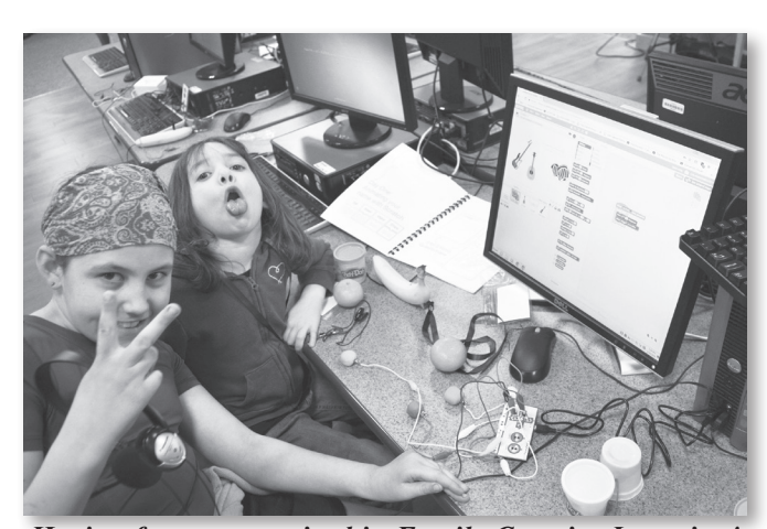
Having fun was required in Family Creative Learning!