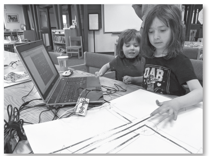
At the end of our workshops, a project showcase gave everyone their ability to try out each family's creation.