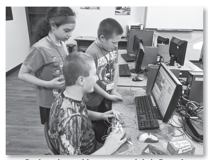
Students learned how to control their Scratch creations with a MakeyMakey.